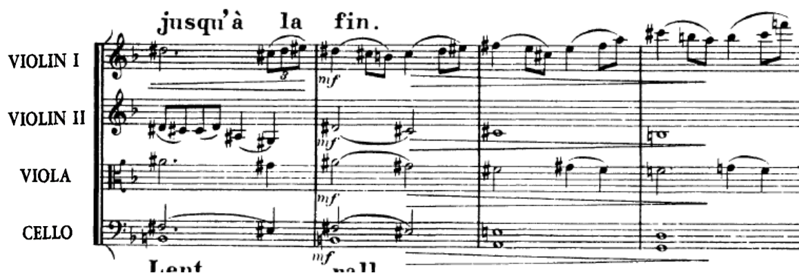
Figure 8 (Ravel Mvt. 1 B Lydian - A Lydian - G Lydian mm. 205-208. Ravel, Maurice. 1987. Quartet in F Major . Mineola: Dover Publications.)