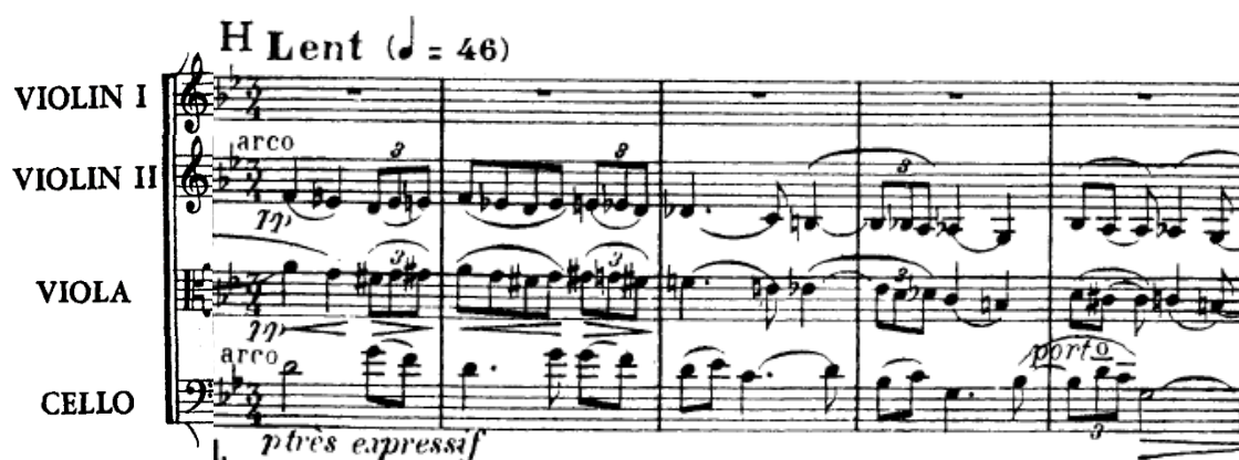
Figure 17 (Ravel Mvt. 2, Chromaticism and the Lydian Mode mm. 89-93. Ravel, Maurice. 1987. Quartet in F Major . Mineola: Dover Publications.)

well – also depicting a departing from the compositional standards of Ravel, given his stricter adherence to Western musical standards and more muted exoticism than Debussy.