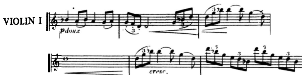
Figure 2 (Debussy Mvt. I Theme B mm. 69-74. Debussy, Claude. 1987. Quartet in G Minor, Op. 10 . Mineola: Dover Publications.)

Throughout the movement, there are slight variations on this theme, but the theme and its variations are only present on the first violin as a main melody. This idea of strictly keeping the melody in the first violin continues throughout the first movement, and as a result, the first movement possesses a mostly polyphonic texture with the first violin being the focus. The variations mostly occur within key changes, and utilize the repetition of brief motives increasing or decreasing in pitch being implanted within the theme before resolving to Theme A. These motives tend to be transitions between Theme B and Theme A, often introducing a key change.