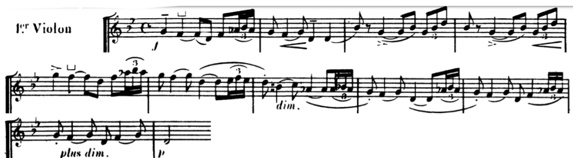
Figure 1 (Debussy Mvt. I Theme A mm. 1-11. Debussy, Claude. 1987. Quartet in G Minor, Op. 10 . Mineola: Dover Publications.)

Both movements of each quartet revolve around a melody presented directly at the beginning, with no introduction. The first theme, Theme A, established for the Debussy Quartet is as such: