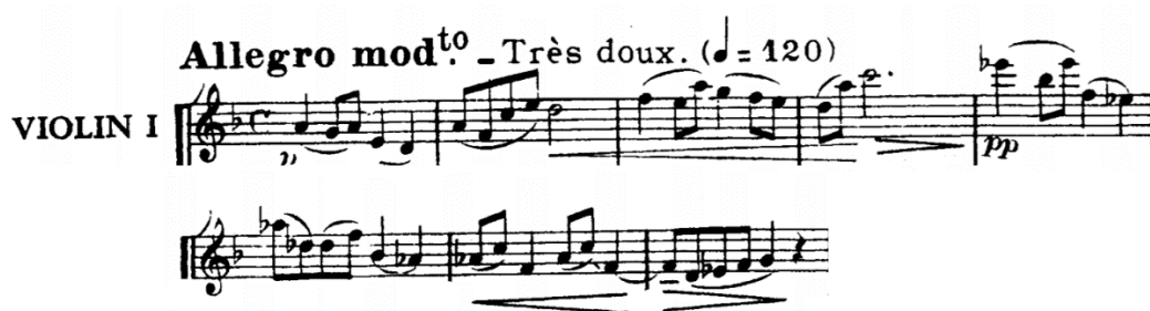
Figure 3 (Ravel Mvt. 1 Main Theme mm. 1-8. Ravel, Maurice. 1987. Quartet in F Major . Mineola: Dover Publications.)

Meanwhile, Ravel relies on more variation on a singular, present theme, displayed in Figure 3.